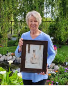
Honorable Mention Winter Rabbit Watercolor Holly Hughes