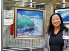
2nd Place Exuberance Pastel Carmen Lamp