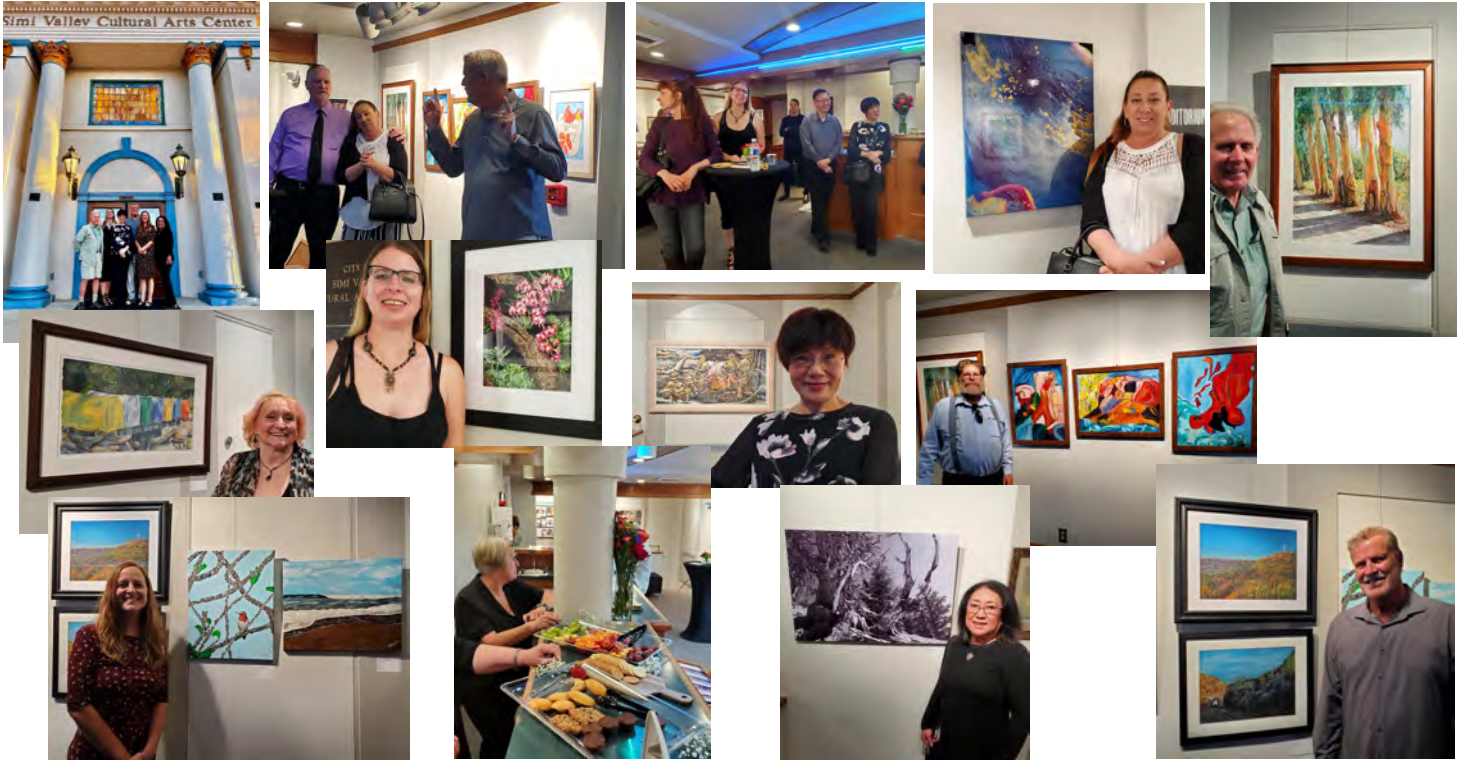
Exhibit runs through June 2nd (Displaying SVAA members only)