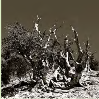
Persy Evans Ancient Bristlecone #5 Photography