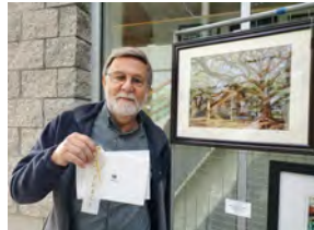
3rd Place Live Oak Photography Frank Perrotta